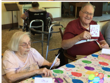
Making Birthday Cards