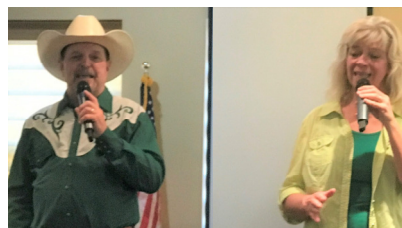
Ambassadors of Grace