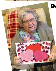
Valentine Heart Art