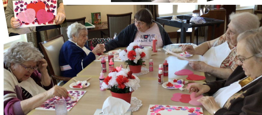
Valentine Heart Votive