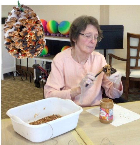
Peanut Butter Pinecone Bird Feeders

Isaiah 55:10-11 As the rain and the snow come down from heaven and do not return to it without watering the earth and making it bud and flourish, so that it yields seed for the sower and bread for the eater, so is my word that goes out from my mouth: It will not return to me empty, but will accomplish what I desire and achieve the purpose for which I sent it.