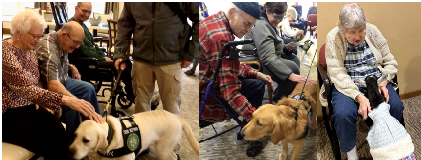
Lambs, New Kyds on the Block, JCSO K9 Visits

Published Monthly for Tenants and Friends of Newton Village.