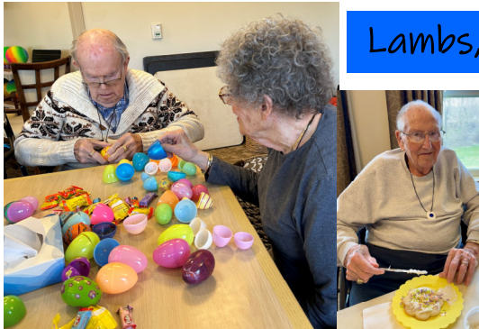
Easter EGG-stravaganza w/Homeschool Group